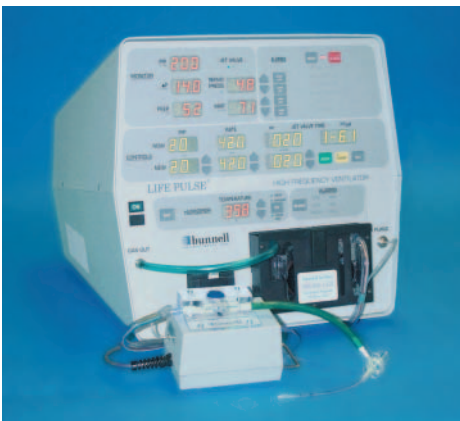
High Frequency "Jet" Ventilator