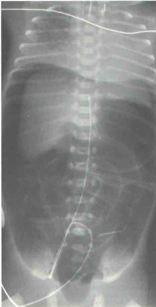
Fig 1. Case 1. Anteroposterior chest-abdomen radiograph demonstrating massive tension pneumoperitoneum, despite peritoneal drain.

The two cases presented also suggest a situation in which another unusual source of air leak, TEF, may be more amenable to high-frequency ventilation than conventional mechanical ventilation. In both instances high ventilatory pressures in the face of altered pulmonary compliance resulted in a situation where barotrauma produced additional air leaks (pulmonary interstitial emphysema, pneumoperitoneum). Moreover, delivered tidal gas took the path of least resistance, moving from trachea to esophagus. Prior to surgical division of the fistula in case 1 and complete resolution of the respiratory distress syndrome in case